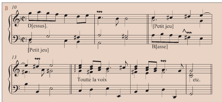
Illustration 3 (above)