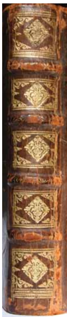
Illustration 1: Spine binding of Selosse Manuscript. Brown calf, finely-tooled and gilded. Typical of library bindings c.1680–1720, possibly French. The binding is very likely original.