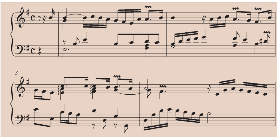
Illustration 7 Chaumont, Allemande en mi , bars 1-4, Premier Ton, Pièces d'orgue , 1695.

As can be seen from even this brief tour of the manuscript, the Seloisse collection displays its rich mixture of diverse musical styles with great subtlety. The paucity of ascriptions and titles is, of course, a serious impediment to a fuller understanding of its contents, and to be regretted. On the other hand, the fact that contemporary political shifts meant that the full religious significance of certain pieces had to be concealed, and one title obliterated, can only tantalise and increase our curiosity to find out more about this remarkable and newly available repertoire. ■