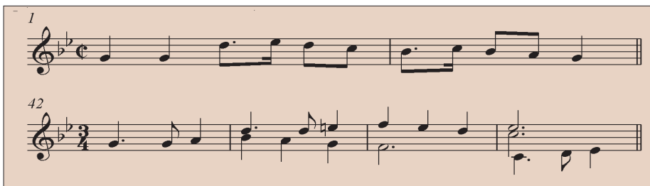
Illustration 8 [Toccata], bars 1-2 and 42-45, Sellose manuscript, pp. 45 and 48.